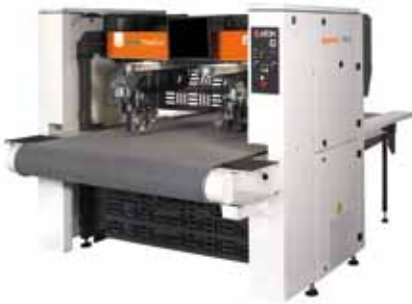
FlashCut Speedy 1660