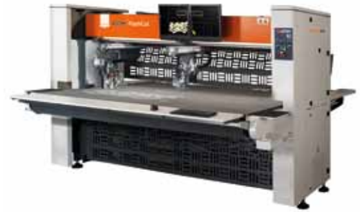
FlashCut Speedy 2660