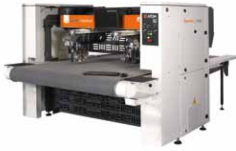
FlashCut Speedy 2160